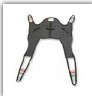
Universal half sling