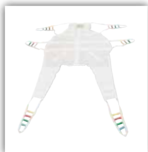
Universal shower sling with head support