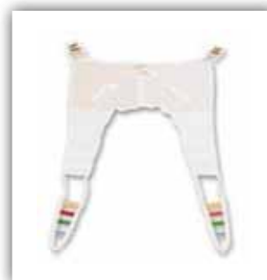
Universal half bath sling