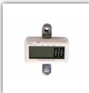
Built-in electronic weighing scale Max. 400 kg