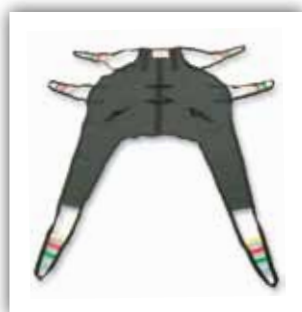
Universal sling with head support